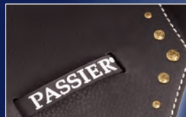
Swarovski Elements in a variety of sizes on the flap