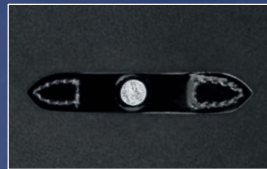
One Swarovski Element on the stirrup strap loop