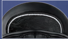
Single row of Swarovski Elements on the cantle