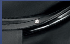
One Swarovski Element on the skirt