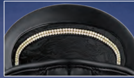
Double row of Swarovski Elements on the cantle