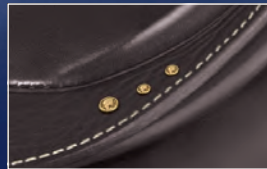
A grouping of Swarovski Elements on the skirt